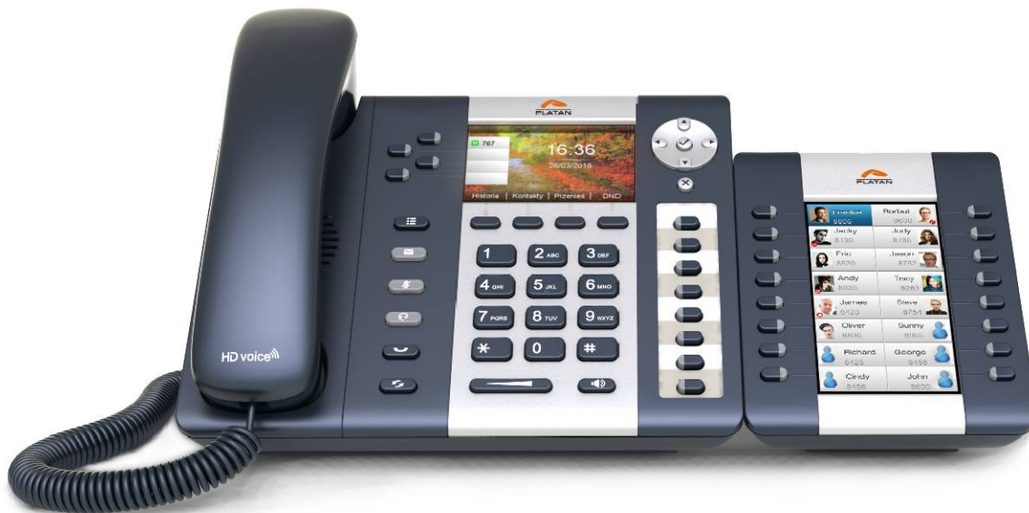
Platan EXT-244CG expansion module with Platan IP-T216CG phone